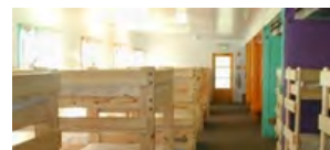
Here is a photo of a Headlands Institute