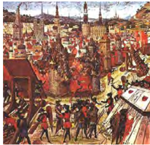
The Crusades were a clash between East and West during the Middle Ages.

We kicked off our Crusades Project today in class. Pairs of students are required to create a Google Earth file (.kmz) that shows the route of Crusaders, the locations of important events, and the results. Images will need to be created by student teams and research is required. See the full project description at: csmhhistory.pbworks.com/Crusades-Project .