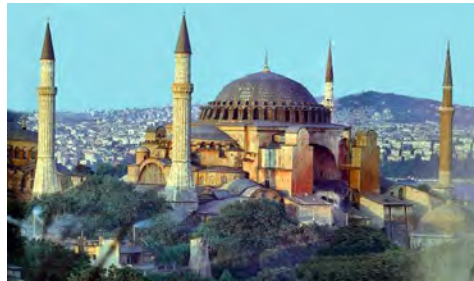
The Hagia Sophia in Istanbul (Constantinople)

Most students did not finish Geography Challenge 2 before class ended on Friday. I collected the students work and will give them some time in class as well as an evening to complete the assignment, but it will be due on January 5th.