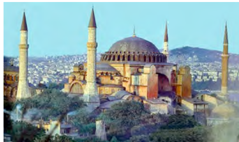
The Hagia Sophia in Istanbul (Constantinople)

7th graders are now learning about the Byzantine Empire - the final vestige of the Roman Empire. This will include a look at the Eastern Orthodox Church and the differences between the Byzantine Empire and Medieval Europe. We are still planning on having a test before we head out for vacation.