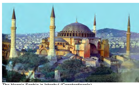
The Hagia Sophia in Istanbul (Constantinople)

Our next section is to learn about the Muslim Religion. I plan to have a speaker come in and talk to the students about the faith.