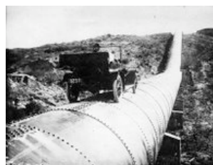
This is the original Los Angeles aqueduct, bringing water from the Owens Valley all the way to LA. This one was built of iron. In the 1970's, another smaller aqueduct was built of steel.

In preparation for the hands-on part of this project, students have taken notes during showings of a Power Point presentation on Roman aqueducts, read an interview with an expert and played a game on a NOVA Internet site, and taken two quizzes on what they are learning. They wrote one note summary early in the week, and turned in another on Friday. They are currently reading an article about the opening of the Los Angeles Aqueduct, published in 1913 in the Los Angeles Times. They have questions to answer and words to define, based on this article, for Tuesday, September 1. On Tuesday, students will propose changes and then finalize the parameters of the project and begin the planning and construction of terrain and their aqueduct.