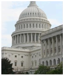
U.S. Capitol Building